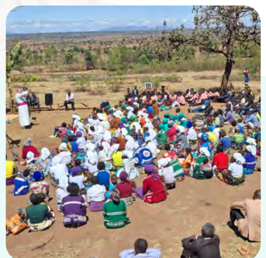
Bishop Conducting Catechesis