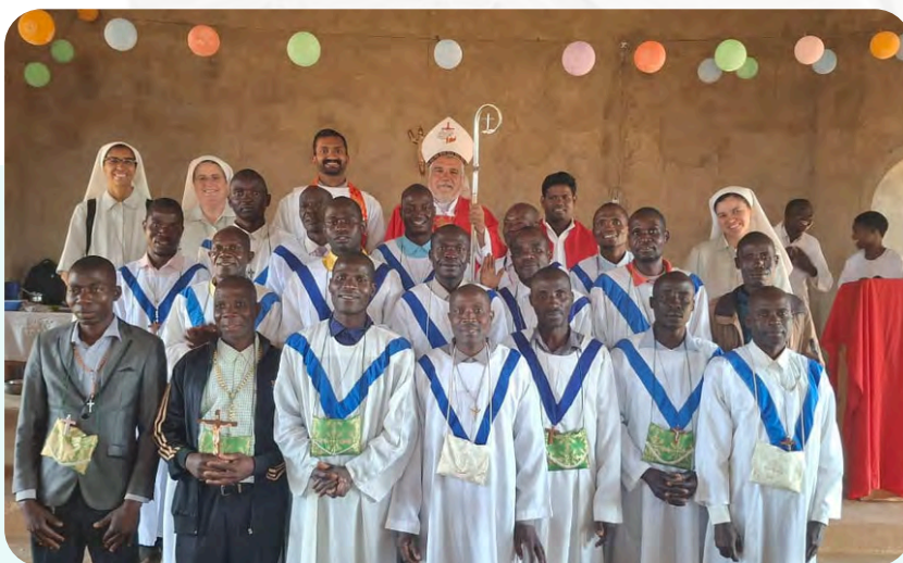
Bishop and Missionary Team with Newly Installed Ministers of Communion